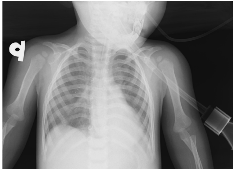
Fig. 3. X-ray was taken after bronchoscopy